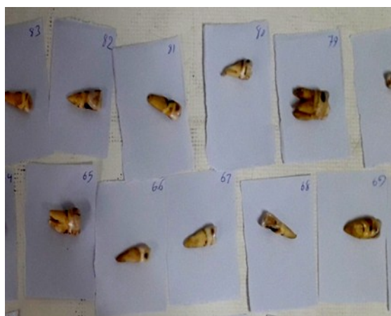
Figure 1. Samples dried at 100°C for 2h.

Where \rho and \rho_b are the number of alpha tracks of the samples (track cm -2 ) and the number of background tracks in the CR-39 detector, respectively, k is the conversion coefficient of 0.0878 track cm -2 Bq -1 day -1 m 3 used to convert alpha track density into radon radioactivity concentration, and t is the exposure time (days). The background track density analysis was performed on a blank detector stored alone.