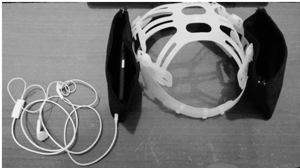
Figure 1. The device used to place a mobile phone on the heads of participants. Connecting the headphones to the mobile phone caused the sound to mute.

In this study, an Iranian-made cell phone called Maad + model GLX was utilized. The SAR The specific absorption rate (SAR) and maximum power value of this phone were 0.253 W/kg and 2W respectively. To place the mobile phone on the participants' heads, we used a homemade device (figure 1).