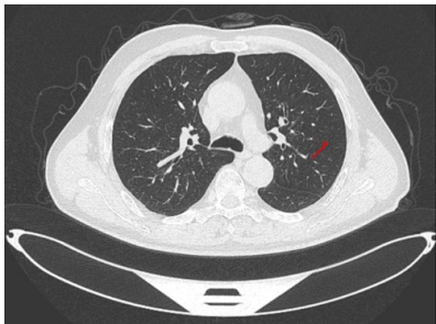
Figure 1. A sample image of multislice CT for lung cancer with a red arrow indicating the region of interest. CT: Computed tomography.

With pathology as the gold standard, 87 out of 102 suspected cases of early-stage lung cancer were pathologically diagnosed with early-stage lung cancer, and the remaining 15 cases were diagnosed with benign lung diseases (figure 1). Furthermore, the sensitivity of 94.25% (82/87), Youden index of 0.743, specificity of 80.00% (12/15), accuracy of 92.16% (94/102), positive diagnostic value of 96.47% (82/85), and negative diagnostic value of 70.59% (12/17) were obtained for multi-slice spiral CT in diagnosing early-stage lung cancer (table 1).