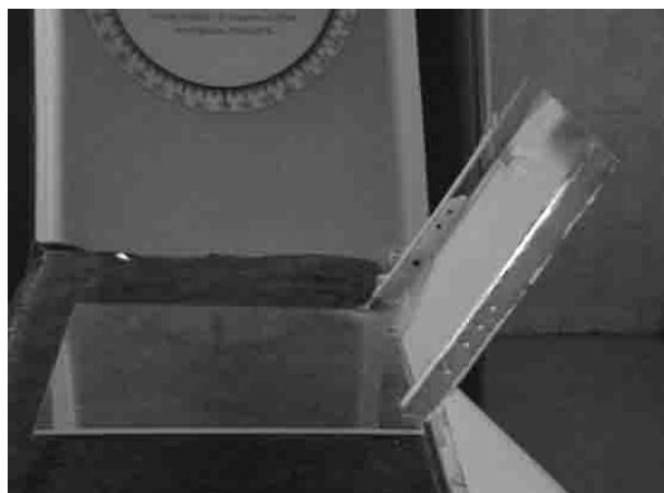
Figure 1. The dedicated cassette holder made from perspex is shown on the treatment couch.

A PC based charge-coupled device (CCD model: RAD system) with 8 bits per pixel and with pixel resolution of 640 \times 480 was used to digitize the portal images. All the images had the same "TIFF" format compatible to the image processing tool box of the MATLAB