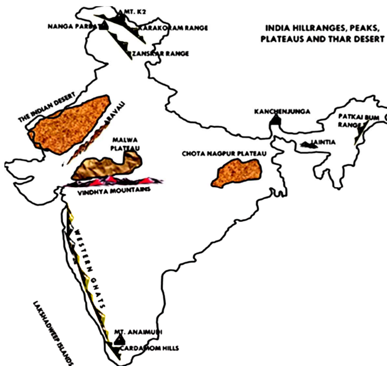
Figure 1. Geographical location of the study area (13).

The Geographical location of the study area is shown in the figure 1. Aravali Range (literally