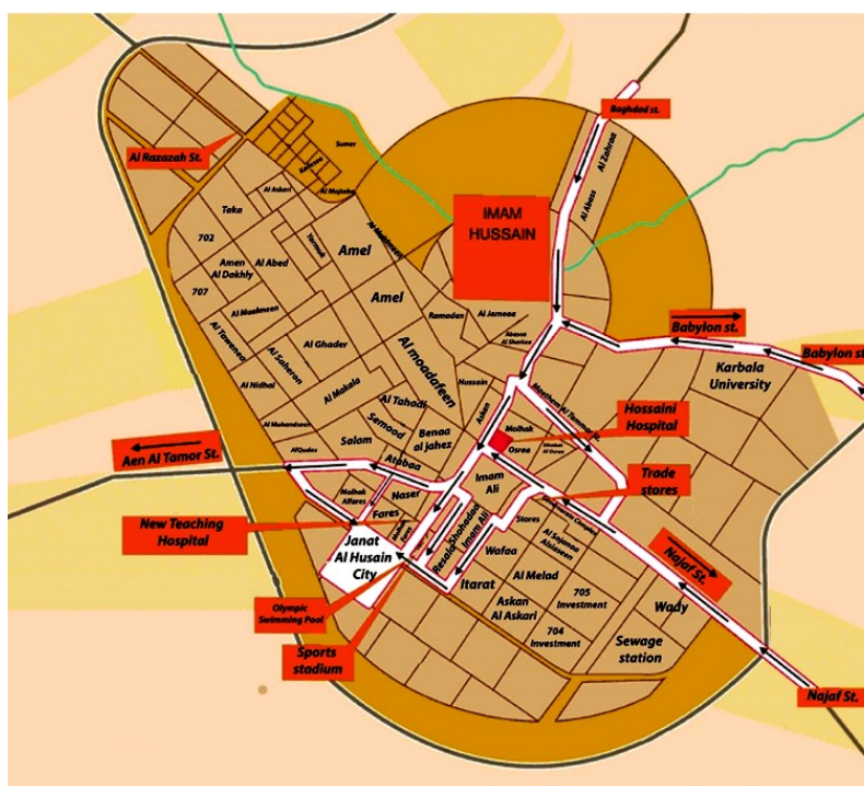
Figure 1. Distribution of sample collection in Karbala.

The energy and efficiency calibration for the detector were achieved using the above sources. The energy calibration showed a straight line with excellent correlation (100%) as illustrated in figure 2(A), while the efficiency calibration showed an exponential relationship with correlation of (99.7%) as in figure 2(B). The photo peaks of 214 Bi (609 keV), 228 Ac (338 keV) and 40 K (1460 keV) were used to specifying the activity of 238 U, 232 Th and 40 K in the soil samples.