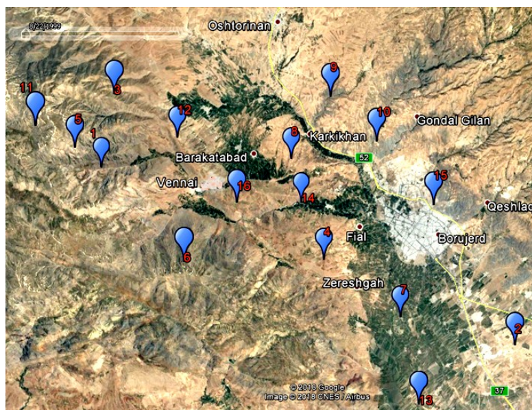
Figure 1. Borujerd County where the numbers indicate sampling sites.