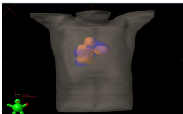
Figure 2. Three dimensional view of PTVs. PTV with blue colour belongs to CT guided delineation. PTV with orange belongs to PET-CT guided delineation. In this patient, PTVpet has a smaller volume than PTVct.

Shervin investigated elective nodal failure as a result of involved field IMRT in 60 limited stage SCLC patients. Only one patient in 30 with recurrence was isolated elective failure (22). In De Ruysscher's study with the use of PET-CT elective nodal failure was 3% (25). In Intergroup 0096 study, 2-year overall and disease-free survival rates were 47% and 29% respectively. Also in RTOG 9311 study failure rate was 8% in NSCLC patients (26). No patients received elective nodal irradiation in our study.