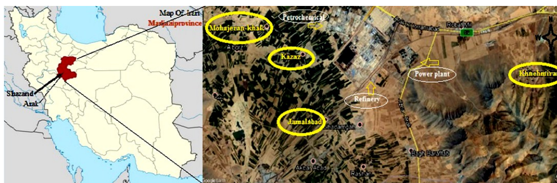
Figure 1. Sampling location map showing study area, Khanemiran, Mahajeran-khak, Kazaz and Jamalabad around of SRC.

Shazand refining and petrochemical plants are located in the city of Shazand in Markazi province in Iran at kilometer 22 of the Arak-Khoramabad road and have been built on an area of 523 hectares. One of the largest producers of oil components, polymers and chemical products, as well as one of the most important projects in Iran was built in 1992 (8) . There are several chimneys that spread fly ash from combustion to the environment.