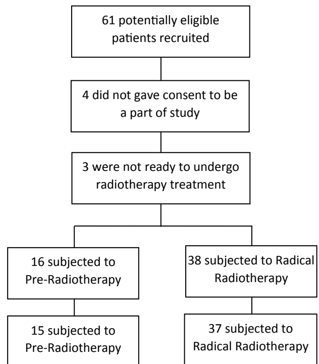
Figure 1. Flow chart for participation.

Out of the 54 patients, 2 patients did not complete the radiation protocol in a timely manner as they were infrequent with their visits. Henceforth a total number of 52 patients were included in this study out of which 15 patients received pre-operative radiotherapy while 37 patients received radical radiotherapy (figure 1).