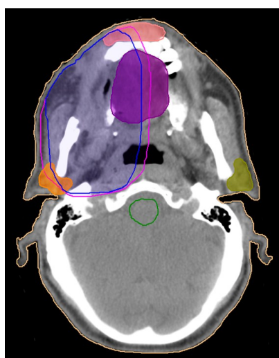
Figure 2. Patient presenting with carcinoma of right mandible with blue demarcation representing the area affected by malignancy; pink demarcation representing the area of radiation therapy.

the machine (figure 2). Only a single specialized investigator assessed the scans so as to avoid any bias. These changes were correlated with the mean dose applied to parotid glands calculated with the help of 3-dimensional treatment planning system. All the parotid glands were analysed for structural changes i.e. density and volume changes based on Computed Tomography data. Further analysis was also done to evaluate the effect of age, gender and mean dose applied to parotid glands.