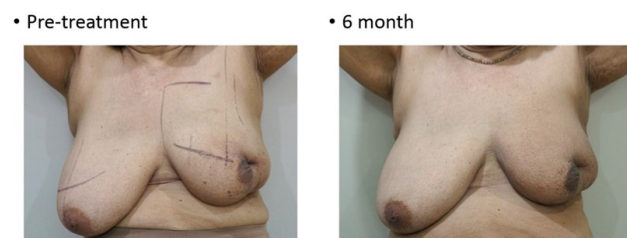
Figure 2. Example of a patient treated to the left breast with a poor cosmetic result: induration and hyperpigmented skin were detected at 6-month follow up.