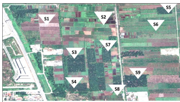
Figure 2. Location of the soil samples taken in the farm located in Klang, Selangor.

An overall total of nine soil samples (S1 to S9) were collected from the study site and transferred to the laboratory in a sealed plastic bag, with each plastic bag being labelled with the required information. All big stones in the soil samples were removed, and the entire sample was sieved in