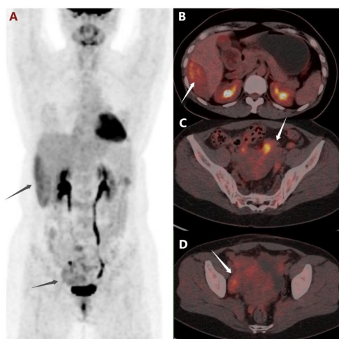
Figure 1. A; The whole-body PET image of case 1. B; DPL nodule in the subcapsular liver and the SUVmax is 3.6. C-D Some DPL nodules near the uterus and the SUVmax is 4.4.

(MRI), these masses located in pelvis, bilateral iliac fossa and pouch of Douglas, appearing as hypointense on T1-Weighted and slight hyperintense on T2-Weighted. PET/CT (GE Discovery STE 16, USA) was suggestive of low FDG uptake for most masses with a SUVmax of 1.9. Moderate uptake of FDG was observed in pelvic cavity with a SUVmax of 3.1. The patient underwent a laparotomy to remove all masses. Histological examination indicated spindle cell tumor, consistent with the smooth muscle tumor. Immunohistochemical staining showed that the spindle cells were positive for smooth muscle actin (SMA), estrogen receptor (ER), progesterone receptor (PR), Desmin and Caldesmon, and the Ki-67 index was 5%. These results supported the diagnosis of disseminated peritoneal leiomyomatosis.