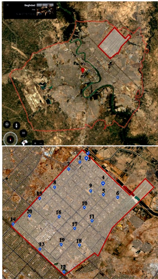
Figure 1. Study region (Google Map, 2021) (14) . Specimen location.

hazards by measuring the concentricity of ^{238}\text{U} , ^{232}\text{Th} , and ^{40}\text{K} in soil specimens selected from various sectors in the city.