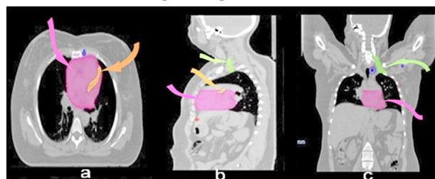
Figure 1. Regions and indicated arrows of heart, brachial plexus, and LAD contours in transverse (a), sagittal (b), and coronal (c) slices (pink: heart, orange: LAD, green: brachial plexus).

fractions to the target volume for patients who underwent a mastectomy and 60 Gy radiation dose who underwent BCS (50 Gy to the entire breast in 25 fractions, axillary and supraclavicular region, and 10 Gy in 5 fractions to the tumor bed for boost dose), respectively. The entire target volume was aimed to receive 95% of the prescription dose.