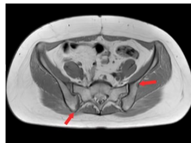
Figure 4. Pelvic magnetic resonance imaging revealed multiple patchy long T1 and long T2 signal shadows in both iliac and sacral bones, suggestive of multiple bone metastases in the tumor.

The MRI results of the patient's entire abdomen and pelvis on December 30, 2021 (using the same MRI model and scanning parameters as previous examinations) showed: multiple irregular and slightly long T1 and T2 signals around the rectum, bladder, anus, and pelvic floor, which were indistinct from the surrounding structures. The size of the larger one was about 7.6 cm \times 5.8 cm, the DWIBS signal was enhanced, and the ADC image showed low signal. The tumour was larger than that before the procedure. In addition, multiple long T1 and T2 signal shadows of the patella were observed in the thoracolumbar spine, bilateral ilia, and sacrum, and the DWIBS signal was obviously enriched, which was consistent with bone metastasis (figure 4). The tumour was staged as T 2b N 1 M 1 . The patient subsequently underwent another session of internal iliac artery infusion chemotherapy (following the same protocol as the previous procedure). During the procedure, a total of 40mg Methylprednisolone, 5mg Tropisetron, 60mg Pirarubicin, and 120mg Cisplatin injection were slowly infused. In February 2022, an additional 120 radioactive seeds were implanted as supplementary treatment within the tumor tissue.