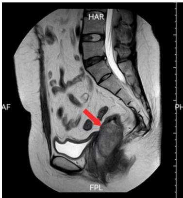
Figure 3. Pelvic magnetic resonance imaging revealed pelvic postoperative changes, soft tissue mass around the rectum, about 4.9cm \times 3.3cm, the DWIBS signal is intensified, suggesting tumor recurrence.

tropisetron (cumulative 5mg), and pirarubicin (cumulative 60mg)—were sequentially infused through bilateral vessels. Unilateral perfusion rates were strictly controlled at \geq 15 minutes per side to ensure regional drug distribution. The protocol was completed over four cycles, with treatment intervals dynamically adjusted based on imaging and laboratory evaluations. On September 9, 2021, the patient underwent pelvic MRI examination using the Philips Prodiva 1.5T CX 1.5T superconducting magnetic resonance imaging system (magnetic field strength of 1.5T, gradient system parameters: maximum gradient field strength of 33 mT/m, gradient slew rate of 160 T/m/s, 16-channel digital radiofrequency reception system, slice thickness resolution \leq 3.0 mm) manufactured by Philips Healthcare (Suzhou) Co., Ltd., Netherlands. Imaging findings revealed: a round long T1 signal and a slightly longer T2 signal around the rectum, which was indistinct from the local boundary of the rectum, the size was approximately 4.9 cm \times 3.3 cm; the DWIBS signal was enhanced and the ADC image showed a low signal, which was considered tumour recurrence (figure 3). In addition, multiple significantly enlarged lymph nodes were observed in front of the sacrum, with a diameter of approximately 2.2 cm, DWIBS signals were significantly enriched, which was consistent with lymph node metastasis, and the tumour was staged as T 2b N 1 M 0 .