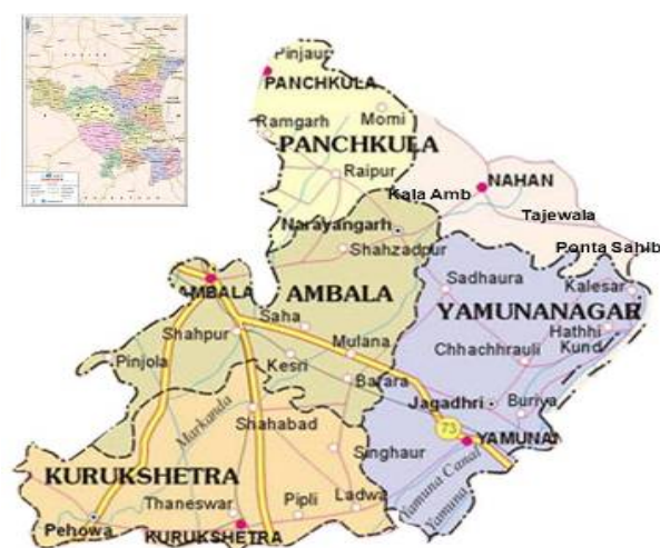
Figure 1. Map of the study area.

The Haryana state of India can be subdivided into two natural areas i.e. Sub-Himalayan terrain and the Indo-Gangatic planes. The plane is fertile and the height above the sea level is 700-900 ft. The slope is from north to south. The climate of the